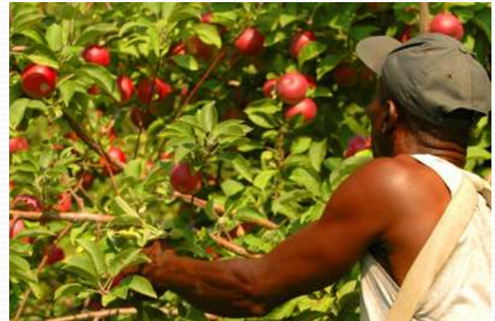
Bottom: Department of Health and Human Services